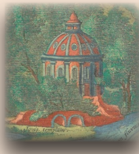
Temple of Zeus