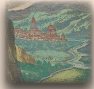
City of Troy